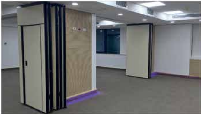
شركة الاتصالات الفلسطينية - نابلس