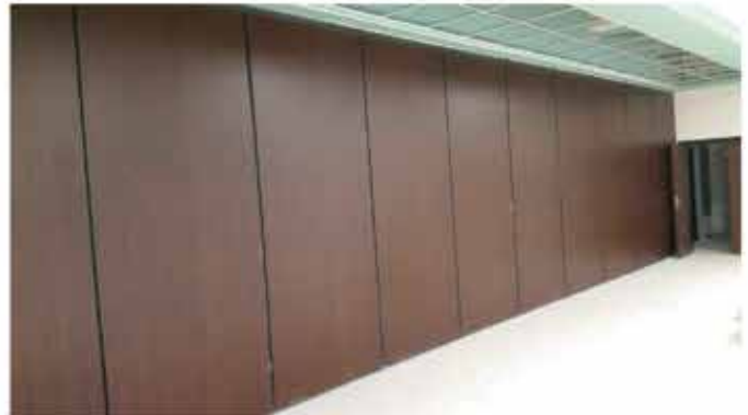
قاعة مجمع رام الله الترويحي