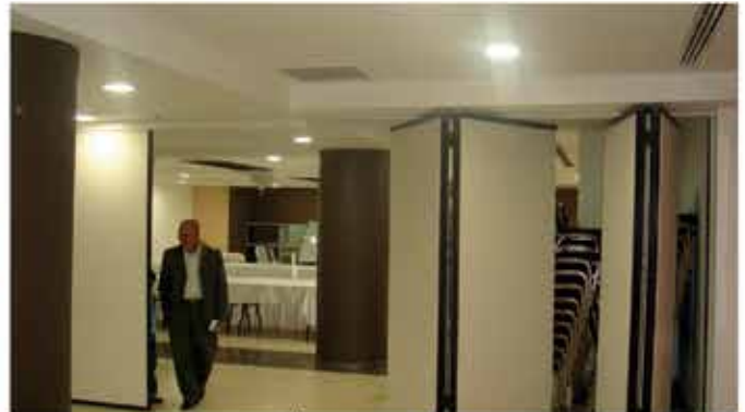
فندق سيزر - رام الله