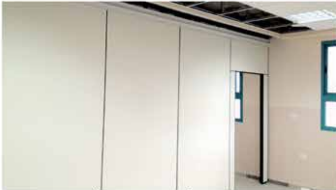
مركز حلحول للأمراض النفسية / الخليل

Seal lowered to floor. Models with 1 1/2" (38mm), 2 1/2" (64mm), and 5 1/2" (141mm) clearance are available. Automatically actuated seals have 1 1/2" (38mm)